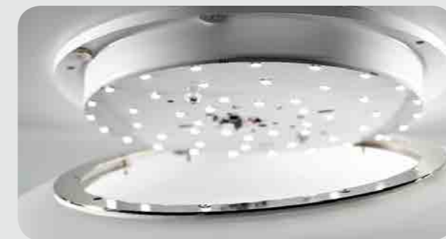
Vetro con attacco a magnete / glass with magnet fixing

LED 2700K - 4000K su richiesta / on request