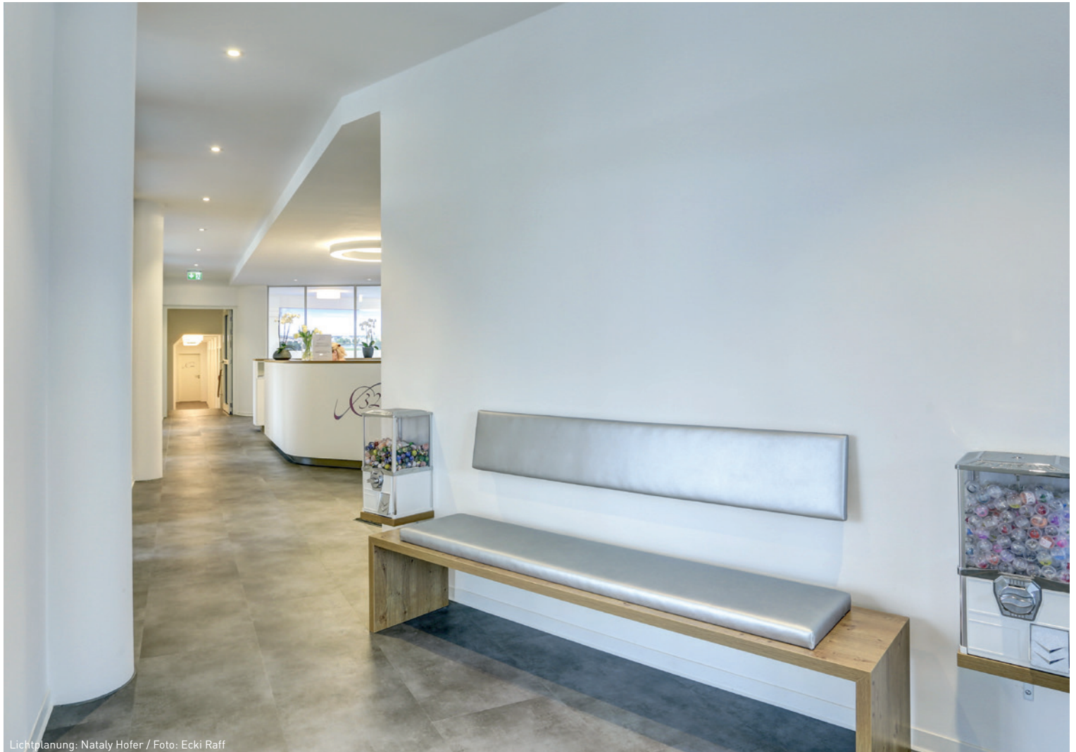
Lichtplanung: Nataly Hofer