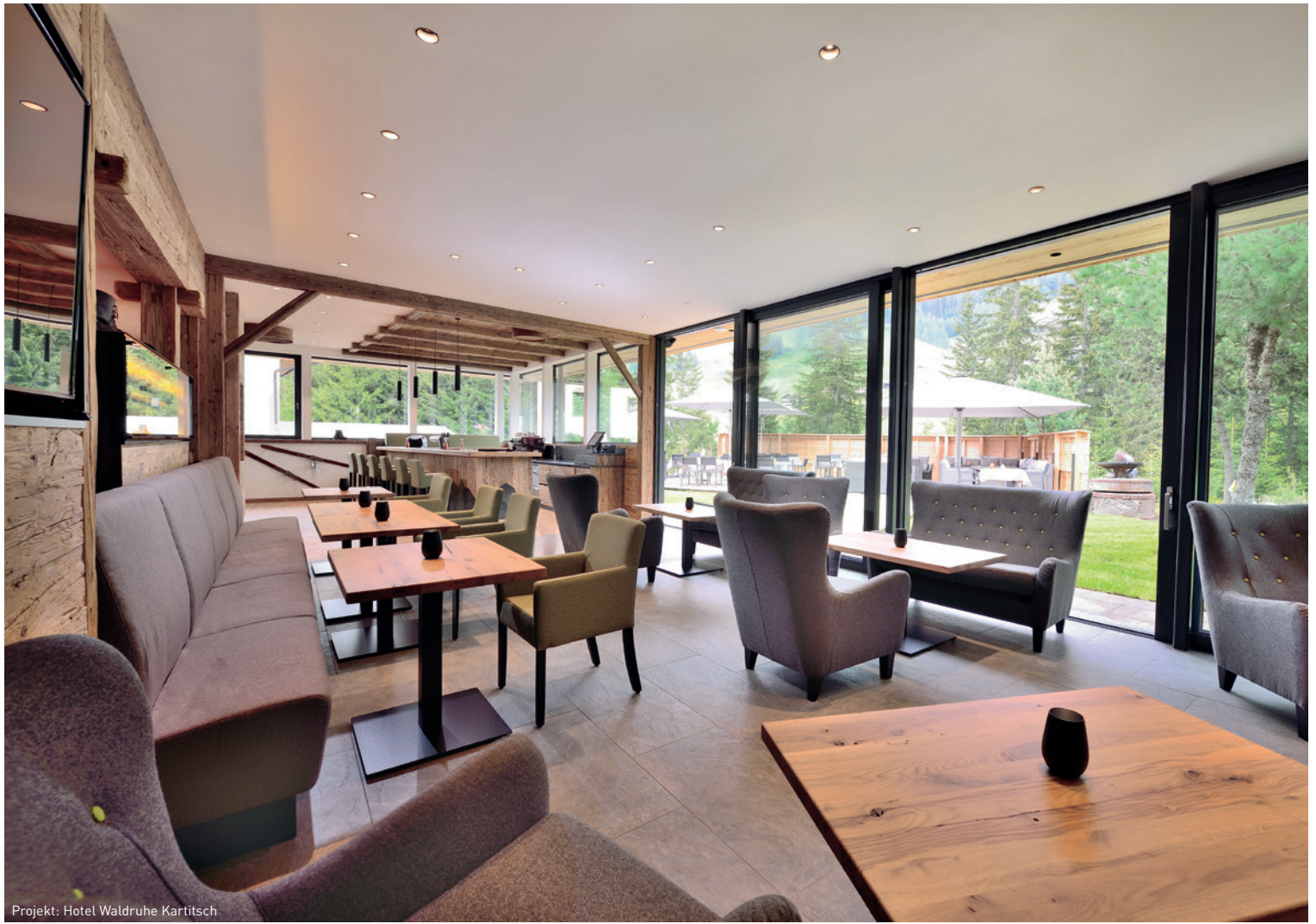
Projekt: Hotel Waldruhe Kartitsch